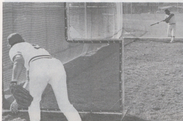
Tunnels for pitching and batting practice.