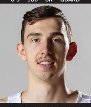
LONGVIEW, WASHINGTON MARK MORRIS HS

3 (2x) last at Loyola Marymount – 02/14/20