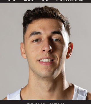
PROVO, UTAH TIMPVIEW HS