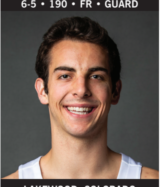
LAKEWOOD, COLORADO CHATFIELD HS