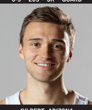
GILBERT, ARIZONA UTAH VALLEY