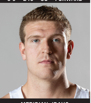
MERIDIAN, IDAHO ROCKY MOUNTAIN HS