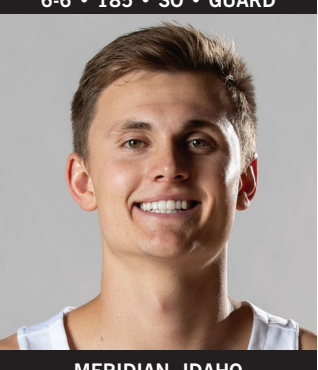
MERIDIAN, IDAHO ROCKY MOUNTAIN HS