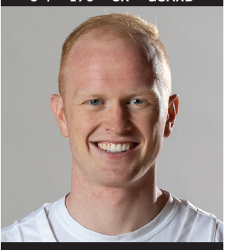
ALPINE, UTAH LONE PEAK HS