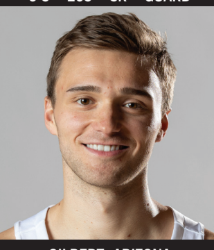
GILBERT, ARIZONA UTAH VALLEY