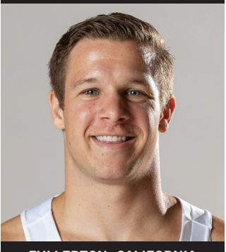
FULLERTON, CALIFORNIA BYU-HAWAII