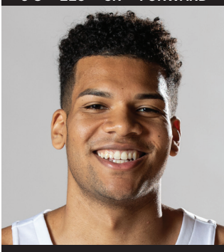
SOUTH JORDAN, UTAH BINGHAM HS