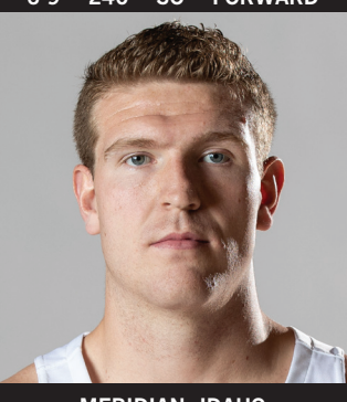
MERIDIAN, IDAHO ROCKY MOUNTAIN HS