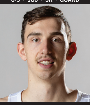
LONGVIEW, WASHINGTON MARK MORRIS HS