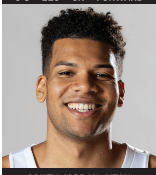
SOUTH JORDAN, UTAH BINGHAM HS