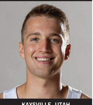
KAYSVILLE, UTAH GONZAGA