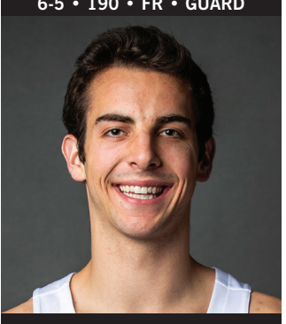
LAKEWOOD, COLORADO CHATFIELD HS