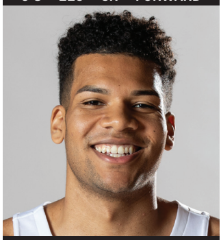
SOUTH JORDAN, UTAH BINGHAM HS