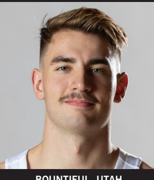
BOUNTIFUL, UTAH BOUNTIFUL HS