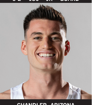
CHANDLER, ARIZONA ARIZONA

2019-20 SEASON HIGHS 18 vs. Weber State - 12/21/19