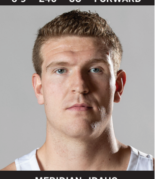
MERIDIAN, IDAHO ROCKY MOUNTAIN HS