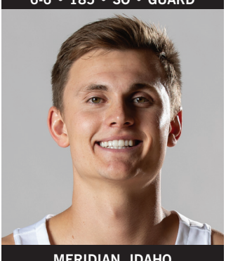
MERIDIAN, IDAHO ROCKY MOUNTAIN HS