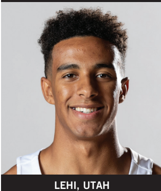
LEHI, UTAH USU EASTERN