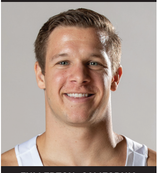
FULLERTON, CALIFORNIA BYU-HAWAII