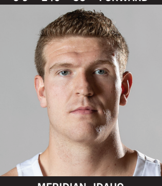
MERIDIAN, IDAHO ROCKY MOUNTAIN HS