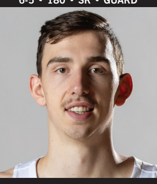
LONGVIEW, WASHINGTON MARK MORRIS HS

3 (2x) last at Loyola Marymount – 02/14/20