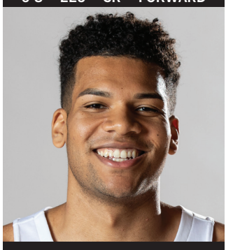
SOUTH JORDAN, UTAH BINGHAM HS