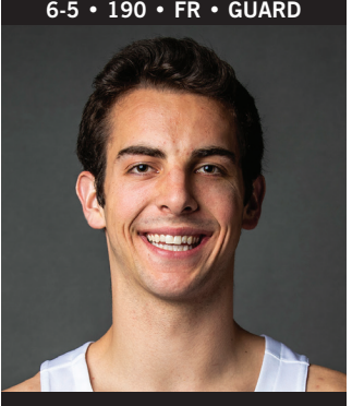
LAKEWOOD, COLORADO CHATFIELD HS