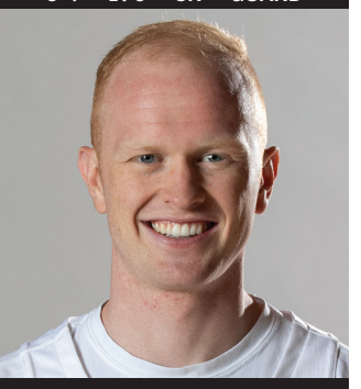
ALPINE, UTAH LONE PEAK HS