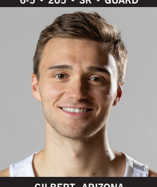
GILBERT, ARIZONA UTAH VALLEY