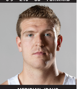
MERIDIAN, IDAHO ROCKY MOUNTAIN HS