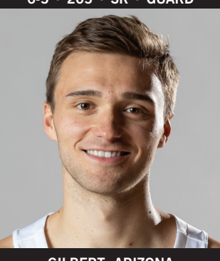
GILBERT, ARIZONA UTAH VALLEY