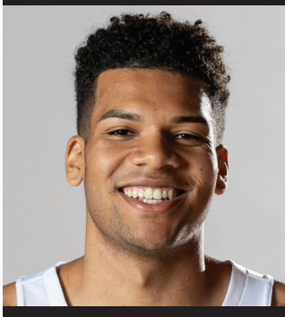
SOUTH JORDAN, UTAH BINGHAM HS