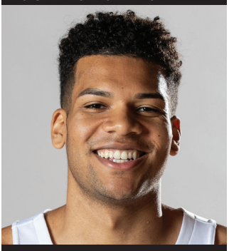
SOUTH JORDAN, UTAH BINGHAM HS