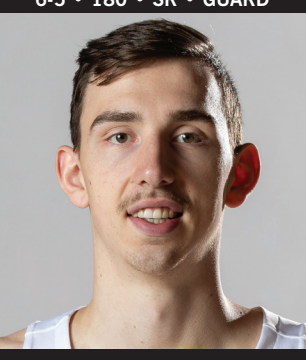
LONGVIEW, WASHINGTON MARK MORRIS HS