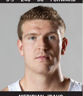
MERIDIAN, IDAHO ROCKY MOUNTAIN HS