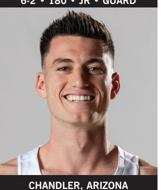
CHANDLER, ARIZONA ARIZONA