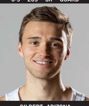
GILBERT, ARIZONA UTAH VALLEY