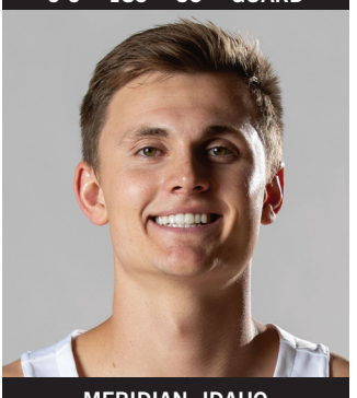
MERIDIAN, IDAHO ROCKY MOUNTAIN HS