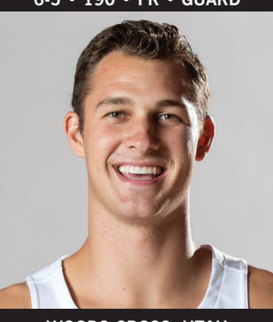
WOODS CROSS, UTAH WOODS CROSS HS