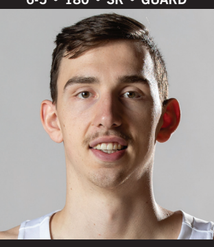
LONGVIEW, WASHINGTON MARK MORRIS HS