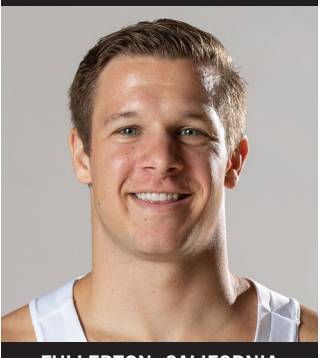
FULLERTON, CALIFORNIA BYU-HAWAII