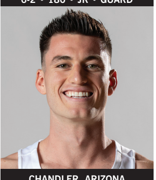
CHANDLER, ARIZONA ARIZONA

2019-20 SEASON HIGHS 18 vs. Weber State - 12/21/19