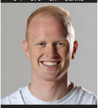
ALPINE, UTAH LONE PEAK HS