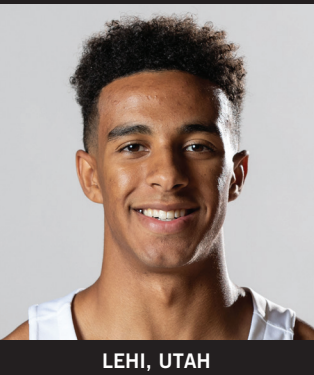
LEHI, UTAH USU EASTERN