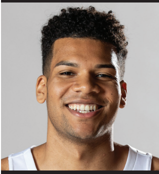
SOUTH JORDAN, UTAH BINGHAM HS