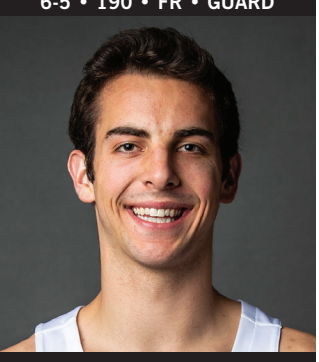
LAKEWOOD, COLORADO CHATFIELD HS