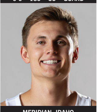
MERIDIAN, IDAHO ROCKY MOUNTAIN HS