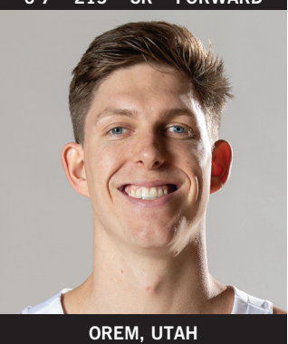
OREM, UTAH OREM HS