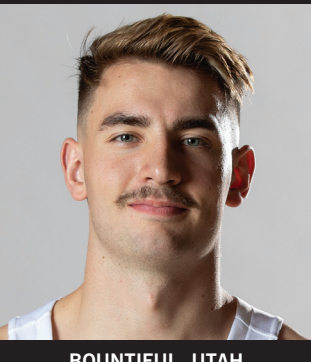
BOUNTIFUL, UTAH BOUNTIFUL HS