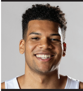
SOUTH JORDAN, UTAH BINGHAM HS