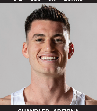
CHANDLER, ARIZONA ARIZONA

2019-20 SEASON HIGHS 18 vs. Weber State - 12/21/19