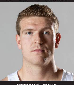
MERIDIAN, IDAHO ROCKY MOUNTAIN HS