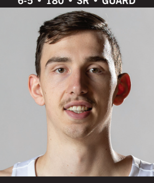
LONGVIEW, WASHINGTON MARK MORRIS HS