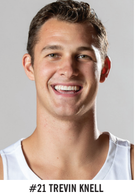
6-5 | 190 | Freshman | Guard Woods Cross, Utah | Woods Cross HS