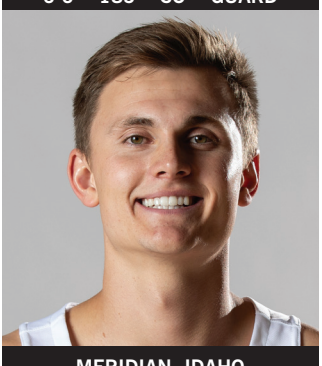
MERIDIAN, IDAHO ROCKY MOUNTAIN HS