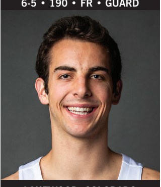
LAKEWOOD, COLORADO CHATFIELD HS