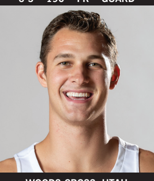
WOODS CROSS, UTAH WOODS CROSS HS