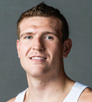
MERIDIAN, IDAHO ROCKY MOUNTAIN HS