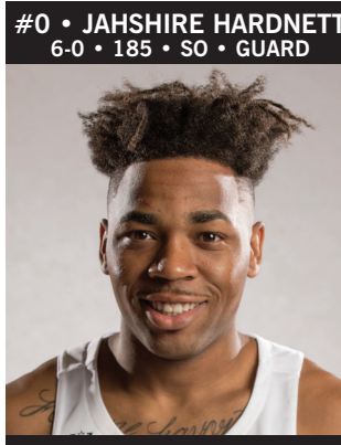
GULFPORT, MISSISSIPPI CHIPOLA COLLEGE