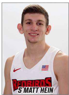
6-3 | 185 | Jr. Windermere, Fla.