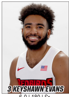
6-0 | 180 | Sr. Fort Lauderdale, Fla.