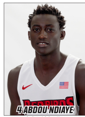
6-9 | 190 | Fr. Louga, Senegal