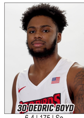
6-4 | 175 | So. Brownsville, Tenn.