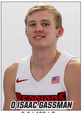
6-5 | 180 | So. Ottawa, III.