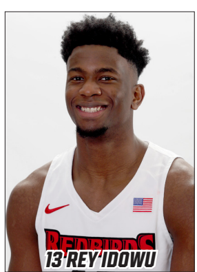
6-9 | 240 | Fr. Melbourne, Fla.