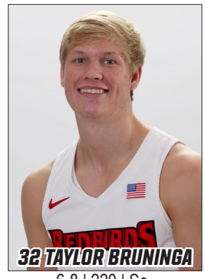
6-8 | 220 | So. Mapleton, III.