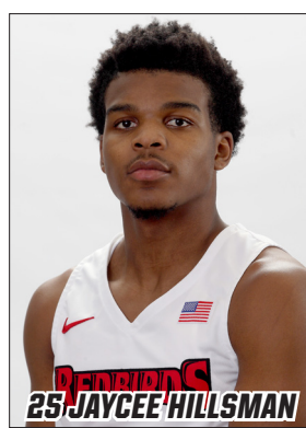
6-6 | 213 | Sr. Champaign, III.