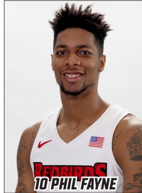
6-9 | 220 | Sr. Elk Grove, Calif.