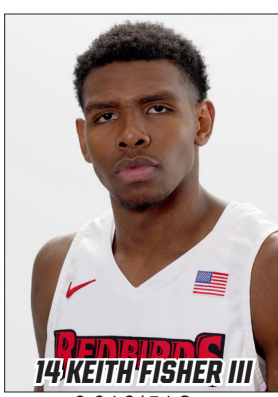
6-8 | 215 | So. Los Angeles, Calif.