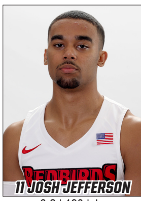
6-2 | 190 | Jr. New Albany, Ind.