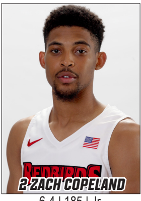
6-4 | 185 | Jr. Oakland, Calif.