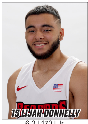
6-2 | 170 | Jr. Bloomington, III.