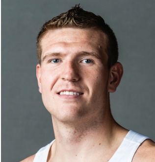
MERIDIAN, IDAHO ROCKY MOUNTAIN HS