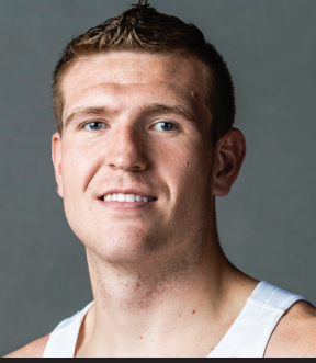
MERIDIAN, IDAHO ROCKY MOUNTAIN HS