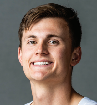
POCATELLO, IDAHO HIGHLAND HS