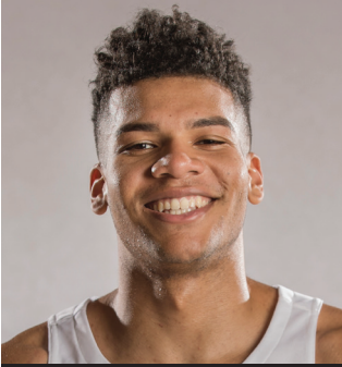
SOUTH JORDAN, UTAH BINGHAM HS