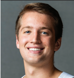
KAYSVILLE, UTAH GONZAGA

2018-19 SEASON — PPG: 0.0 RPG: 0.0 APG: 0.0 BPG: 0.0 SPG: 0.0 FG%: .000 3FG%: .000 FT%: .000