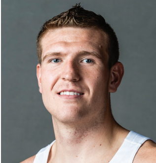
MERIDIAN, IDAHO ROCKY MOUNTAIN HS