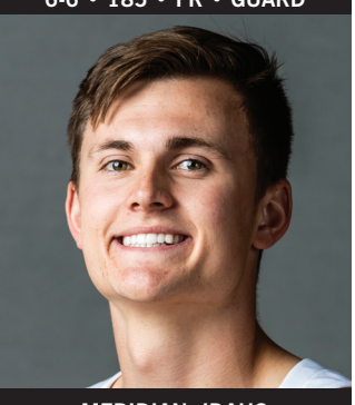
MERIDIAN, IDAHO ROCKY MOUNTAIN HS