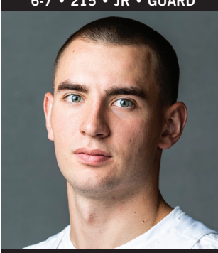
BOUNTIFUL, UTAH BOUNTIFUL HS