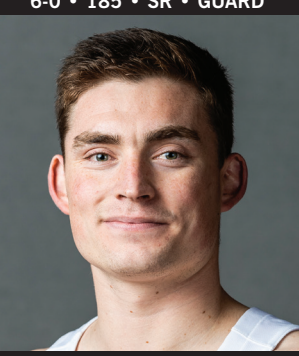
SHELLEY, IDAHO WEBER STATE