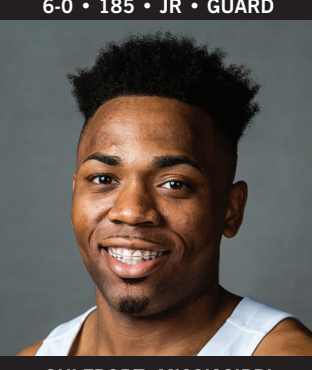
GULFPORT, MISSISSIPPI CHIPOLA COLLEGE