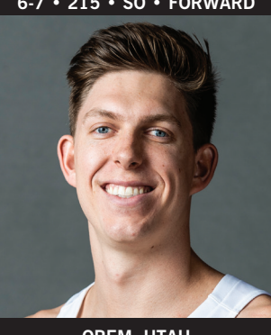
OREM, UTAH OREM HS