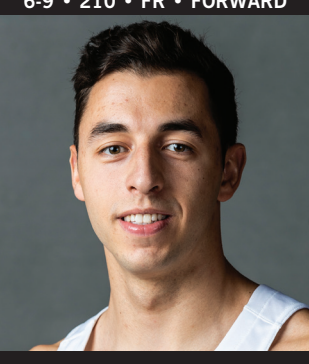
PROVO, UTAH TIMPVIEW HS

4 (2x) last vs. Northwestern State – 11/13/18