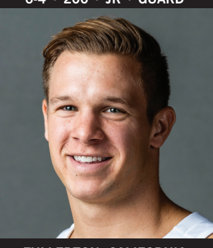
FULLERTON, CALIFORNIA BYU-HAWAII