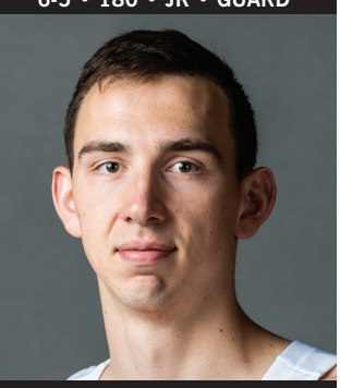
LONGVIEW, WASHINGTON MARK MORRIS HS