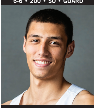
BOISE, IDAHO LINK YEAR