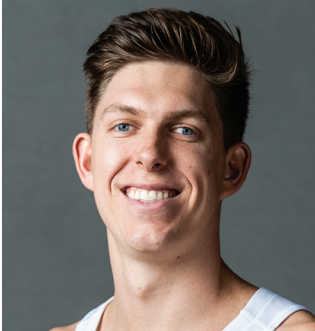
OREM, UTAH OREM HS