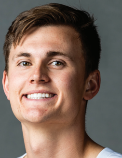
POCATELLO, IDAHO HIGHLAND HS

2018-19 SEASON — PPG: 6.4 RPG: 3.1 APG: 1.4 BPG: 0.2 SPG: 0.4 FG%: .475 3FG%: .327 FT%: .682