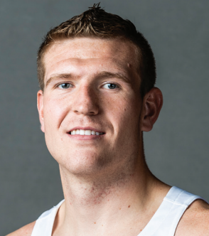
MERIDIAN, IDAHO ROCKY MOUNTAIN HS