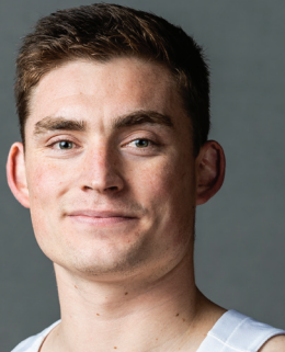
SHELLEY, IDAHO WEBER STATE