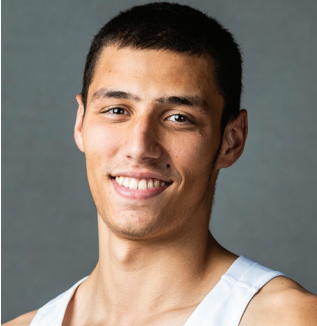
BOISE, IDAHO LINK YEAR

2018-19 SEASON — PPG: 2.6 RPG: 1.1 APG: 0.5 BPG: 0.2 SPG: 0.1 FG%: .400 3FG%: .292 FT%: .593