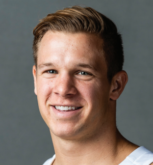
FULLERTON, CALIFORNIA BYU-HAWAII

2018-19 SEASON — PPG: 0.2 RPG: 0.2 APG: 0.1 BPG: 0.0 SPG: 0.0 FG%: .000 3FG%: .000 FT%: 1.000