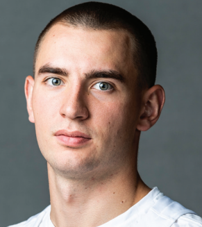
BOUNTIFUL, UTAH BOUNTIFUL HS