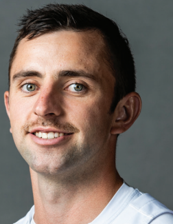
ALPINE, UTAH LONE PEAK HS

2018-19 SEASON — PPG: 5.8 RPG: 1.5 APG: 1.5 BPG: 0.0 SPG: 0.9 FG%: .380 3FG%: .323 FT%: .769