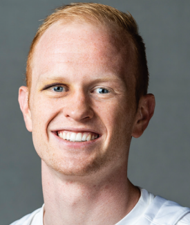
ALPINE, UTAH LONE PEAK HS

2018-19 SEASON — PPG: 17.5 RPG: 4.2 APG: 5.2 BPG: 0.4 SPG: 1.0 FG%: .500 3FG%: .405 FT%: .855