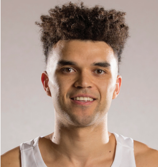
GWINNETT, GEORGIA ELON