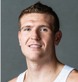
MERIDIAN, IDAHO ROCKY MOUNTAIN HS