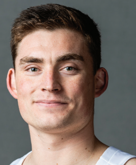
SHELLEY, IDAHO WEBER STATE