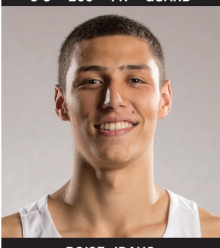
BOISE, IDAHO LINK YEAR