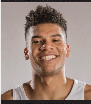
SOUTH JORDAN, UTAH BINGHAM HS