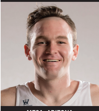
MESA, ARIZONA MOUNTAIN VIEW HS