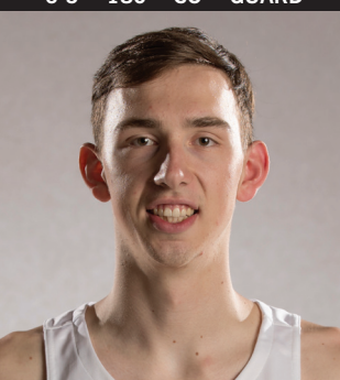
LONGVIEW, WASHINGTON MARK MORRIS HS