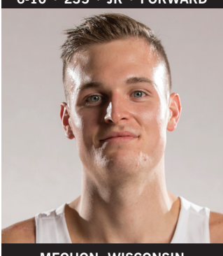
MEQUON, WISCONSIN HOMESTEAD HS