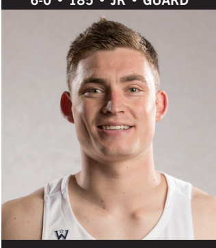
SHELLEY, IDAHO WEBER STATE