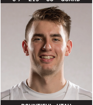
BOUNTIFUL, UTAH BOUNTIFUL HS