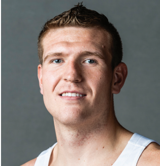
MERIDIAN, IDAHO ROCKY MOUNTAIN HS