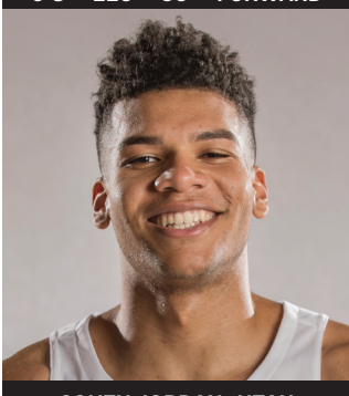
SOUTH JORDAN, UTAH BINGHAM HS