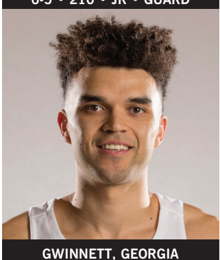
ELON 2017-18 SEASON HIGHS