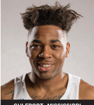
GULFPORT, MISSISSIPPI CHIPOLA COLLEGE