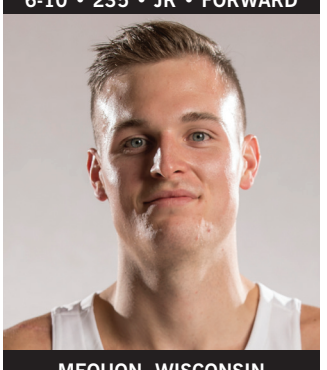
MEQUON, WISCONSIN HOMESTEAD HS