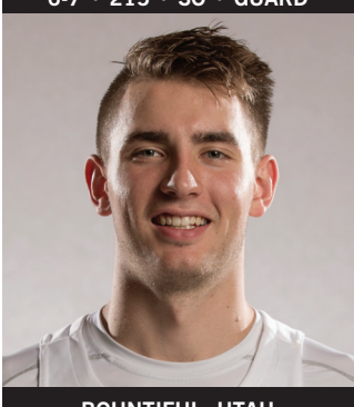
BOUNTIFUL, UTAH BOUNTIFUL HS