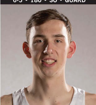
LONGVIEW, WASHINGTON MARK MORRIS HS