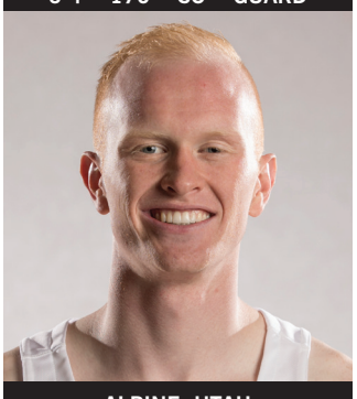
ALPINE, UTAH LONE PEAK HS