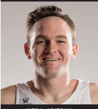
MESA, ARIZONA MOUNTAIN VIEW HS