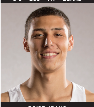
BOISE, IDAHO LINK YEAR