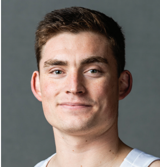
SHELLEY, IDAHO WEBER STATE