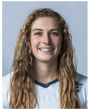
Senior • OH