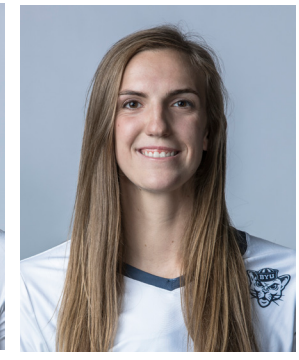
Sophomore • OPP