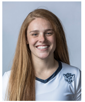
Senior • DS/L