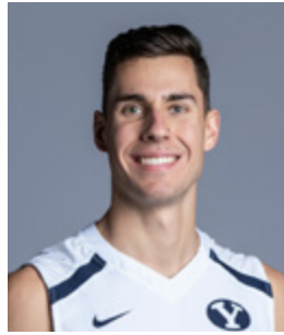
#9 Andrew Lincoln