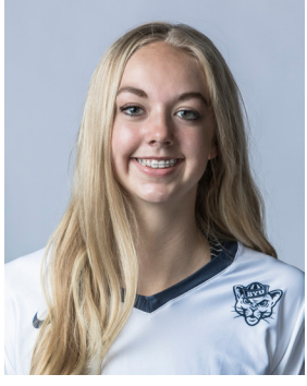
Freshman • MB