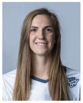
Sophomore • OPP