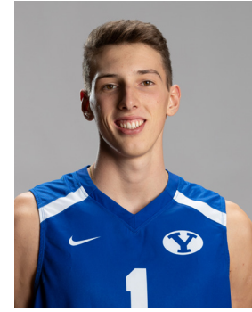
Freshman • OH