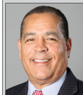
KELVIN SAMPSON Head Coach 5th Season at Houston 30th Season Overall