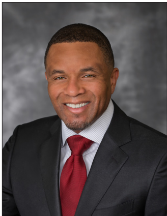
Damon Stoudamire Head Coach