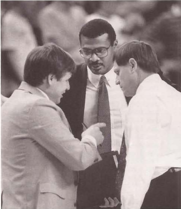
New coaching staff won conference championship.