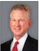
TOMMY TUBERVILLE Head Coach