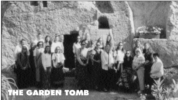
THE GARDEN TOMB