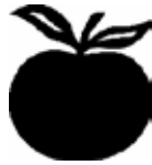
Tangerine Bowl - 1976