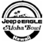
Aloha Bowl - 1992