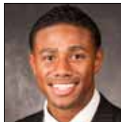
FRESHMAN / WIDE RECEIVER / 6-3 / 206