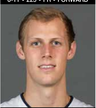
MISSION VIEJO, CALIFORNIA MISSION VIEJO HS