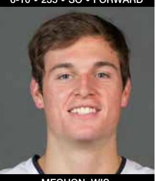
MEQUON, WIS. HOMESTEAD HS