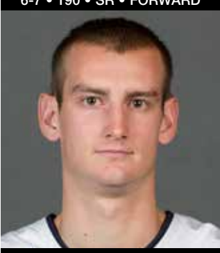
HIGHLAND, UTAH UTAH