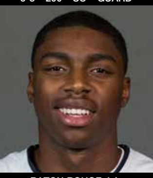
BATON ROUGE, LA. FUTURE COLLEGE PREP