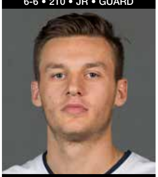
PROVO, UTAH PROVO HS