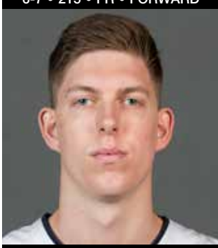
OREM, UTAH OREM HS