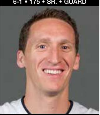
OREM, UTAH SALT LAKE CC