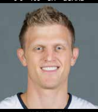
ALPINE, UTAH LONE PEAK HS