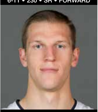
ALPINE, UTAH LONE PEAK HS