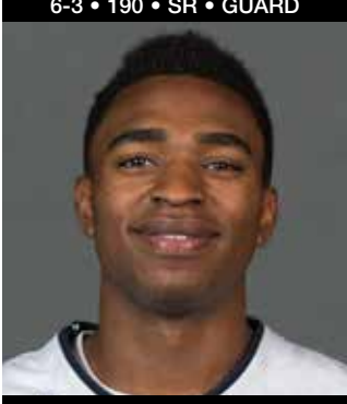
LAS VEGAS, NEV. BISHOP GORMAN