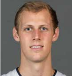
MISSION VIEJO, CALIFORNIA MISSION VIEJO HS

2014-15 SEASON — PPG: 0.0 RPG: 0.0 APG: 0.0 SPG: 0.0 BPG: 0.0 FG%: .000 3FG%: .000 FT%: .000