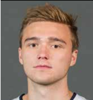
GILBERT, ARIZONA HIGHLAND HS