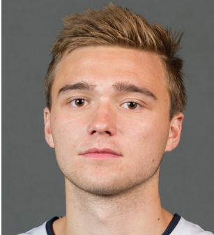
GILBERT, ARIZONA HIGHLAND HS