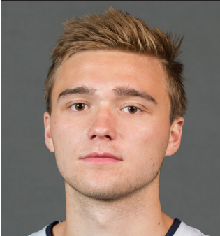
GILBERT, ARIZONA HIGHLAND HS