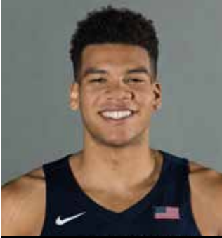
SOUTH JORDAN, UTAH BINGHAM HS

2016-17 SEASON — PPG: 5.0 RPG: 6.0 APG: 0.0 BPG: 1.0 SPG: 0.0 FG%: .400 3FG%: .000 FT%: .250