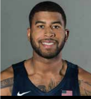
HOUSTON, TEXAS HOUSTON

2016-17 SEASON — PPG: 4.0 RPG: 3.0 APG: 3.0 BPG: 0.0 SPG: 0.0 FG%: .167 3FG%: .000 FT%: .500