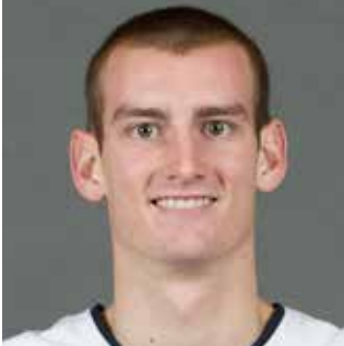
HIGHLAND, UTAH UTAH