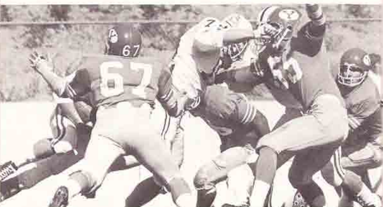
Defensive pursuit against USU