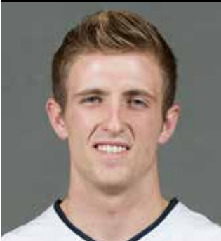
ST. GEORGE, UTAH SNOW CANYON HS

2013-14 SEASON — PPG: 0.5 RPG: 1.0 APG: 0.5 SPG: 0.0 BPG: 0.0 FG%: .000 3FG%: .000 FT%: .500