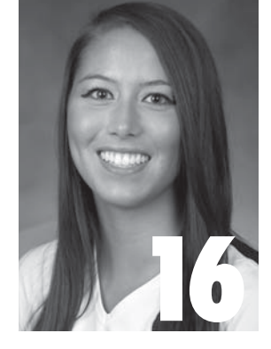
Season and Career Highs