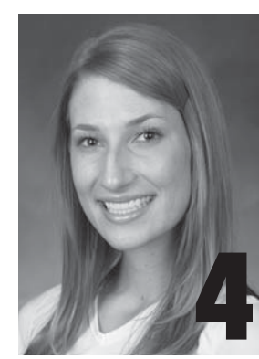
Season and Career Highs