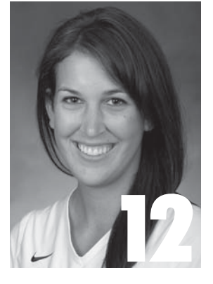
Season and Career Highs